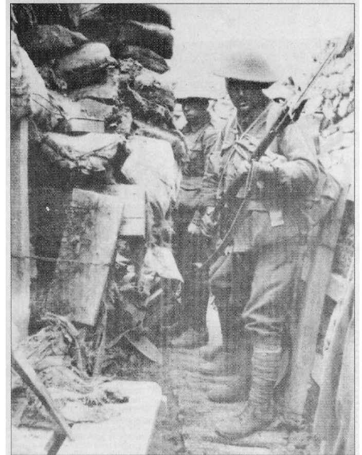
Huge toll: The Fromelles search has been handled differently from the hunt for HMAS Sydney

www.theaustralian.com.au/highereducation