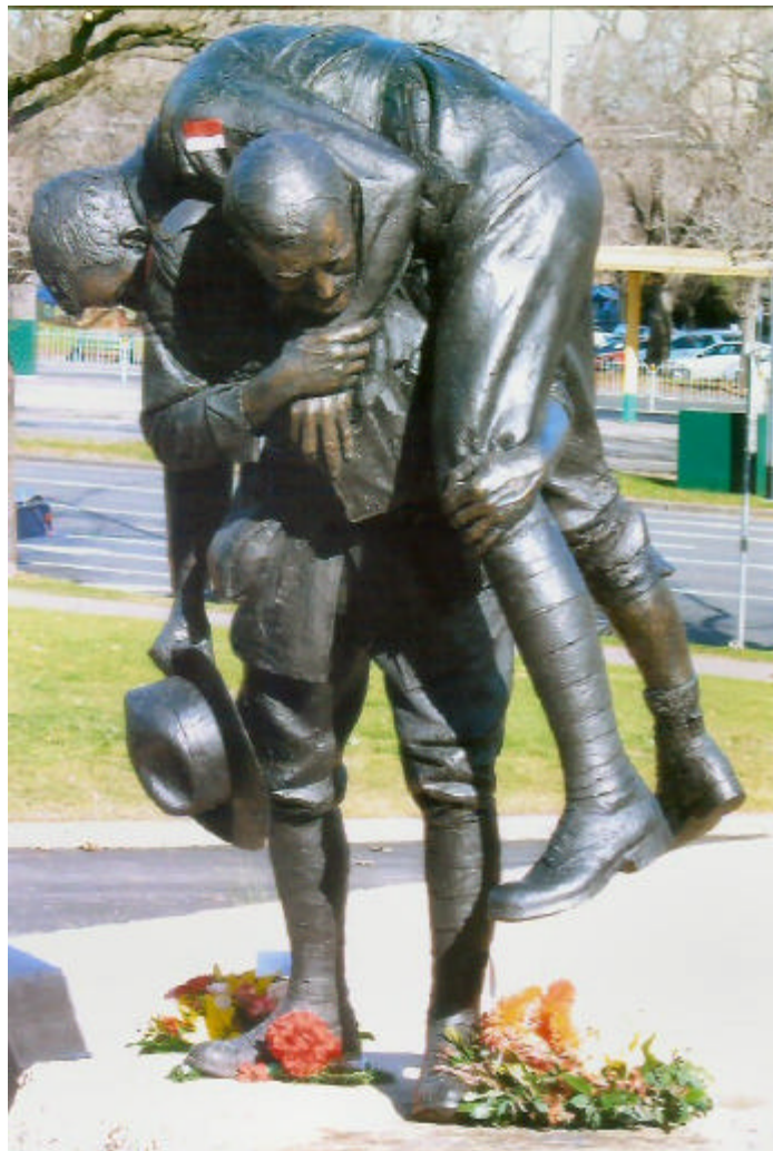
PHOTOGRAPH: Lest We Forget- Cobbers Statue Unveiled: 92nd anniversary of the Battle of Fromelles. [The human face of tragedy depicted in a magnificent sculpture which encapsulates an extraordinary act of bravery].